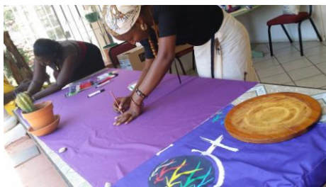
Painting our banners

movement in the continent and the opportunities that the 4th International Action offers for the consolidation and expansion of the WMW. Together in plenary and by work groups, African partners planned joint strategies for coordination and mobilization in 2015.