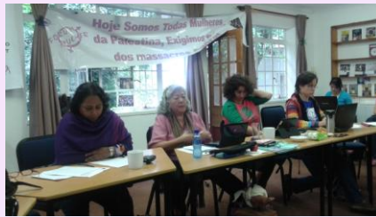
Gathered in plenary