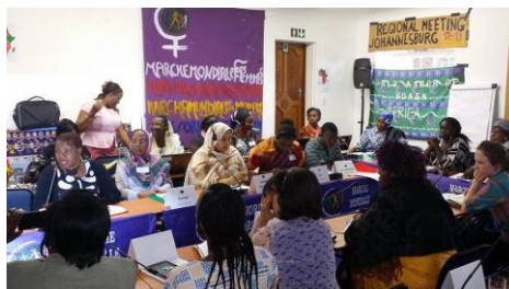
Gathered in plenary