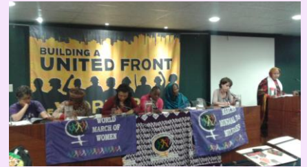
Sisters in the public platform of NUMSA