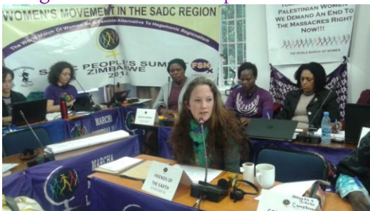
Delegate from Friends of the Earth International

Delegates from some allied organizations like Friends of the Earth International, La Via Campesina and CADTM also participated in the meeting in order to promote convergences and to strengthen our partnerships in Africa.