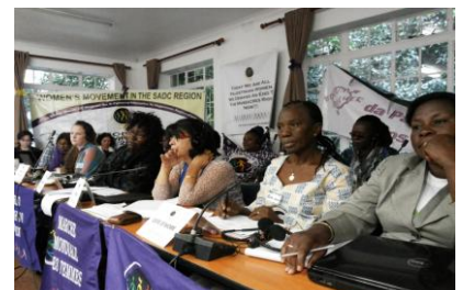
Gathered in plenary