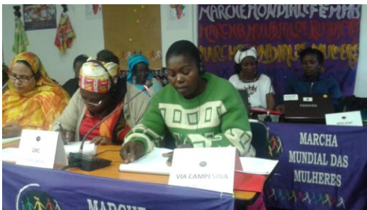
Delegate from La Vía Campesina