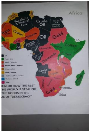
Natural resources African map