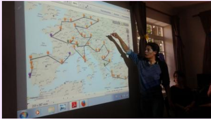
European delegate explaining the feminist caravan's itinerary for the 4th International Action.