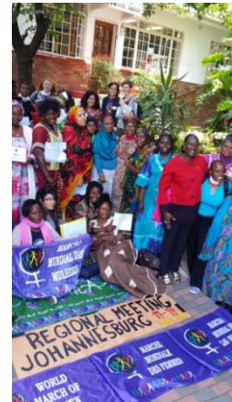
Participants of the African Meeting