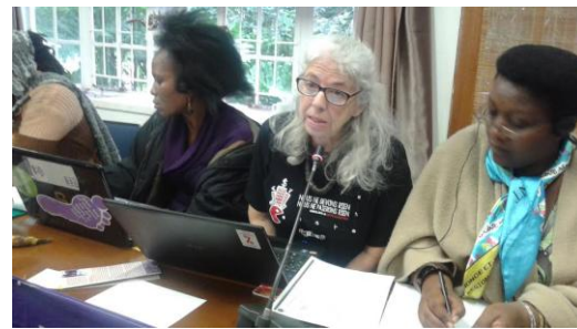
Delegate from CADTM