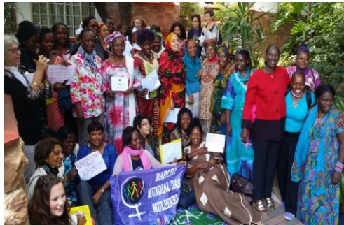
Participants of the African Meeting