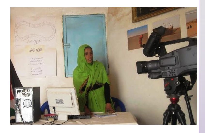
"Saharawi women are prepared to live in peace, but as women there are still many things to achieve and consolidate"

For further information and to support the Sahrawi cause with demonstrations of solidarity, please contact Chaba Seny (email: <a href="mailto:chaba.seiny@yahoo.es">chaba.seiny@yahoo.es</a>).