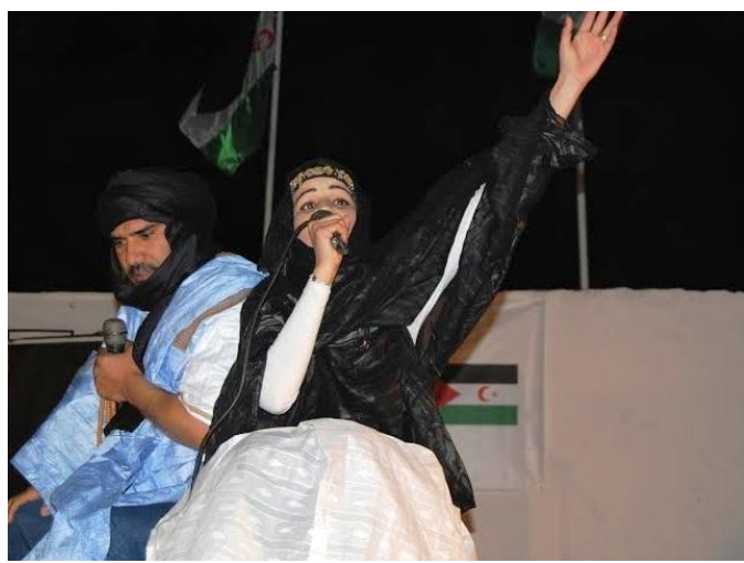
women, the struggle for women's emancipation and for more equitable gender relations between women and men. Among others

professional level. This was possible, among other things, thanks to the changes lived within the National Union of Saharawi Women (UNMS, acronym in Spanish) which, alongside with the agenda for national independence, has targeted the specific needs of