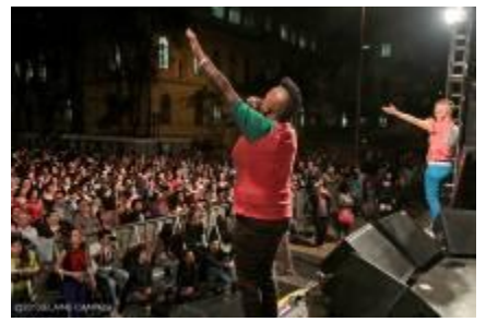
Feminist hip hop from Cuban group Krudas Cubensi, during the closing act, on the 31<sup>st</sup> August

Audiovisual materials Pictures http://www.flickr.com/photos/marchamulheres/