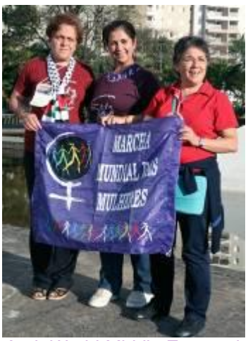
Arab World-Middle East region