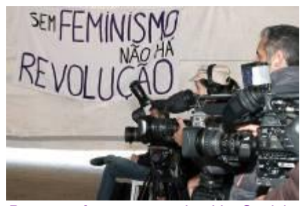
Press conference organised by Social Movements Communications Convergence