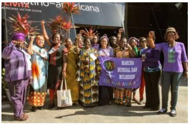
Participants of the Africa region

Differently from previous actions, which concluded with a centralised global action in a given country, the actions in 2015 will include caravans, actions and regional meetings, held between 8^{th} March and 17^{th} October to which delegates from other regions will be invited. In addition, we will organise 24 Hours of Feminist Action on the 24^{th} April, in memory of the more than 1,000 women who died this year in Bangladesh, in the collapse of the factory where they worked.