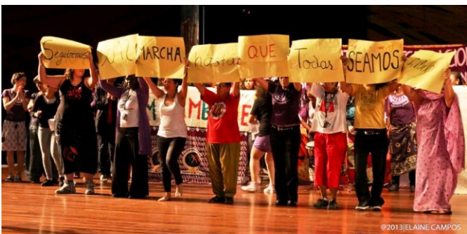
"Women on the March Until We are all Free!!", 9<sup>th</sup> International Meeting final assembly, morning of 31<sup>st</sup> August

The city of São Paulo, Brazil, was the epicentre of debates, actions and displays of cross-border feminist solidarity, during the 9th International Meeting of the World March of Women, held from the 25^{\text{th}} - 31^{\text{st}} August, under the slogan "Feminism" in March to change the World!". The IM was attended by 1,650 women from different parts of Brazil and the world, including delegates, observers, workers and guests from invited movement and organisations: ALAI - Latin American News Agency, Friends of the Earth International, AWID - Association of Women's Rights in Development, ITUC – International Trade Union Confederation, REMTE - Network of Women Transforming the Economy, GGJ - Grassroots Global Justice, Via Campesina, Women on Web, WRM - World Rainforest Movement, WIDF - Women's International Democratic Federation and OIF - International Francophone Organisation, OIF. The participants came from a total of 50 countries: Afghanistan, Angola, Argentina, Australia, Bangladesh, Basque Country, Belgium, Bolivia, Brazil, Bulgaria, Burkina Faso,