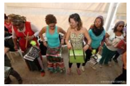
"Batucada" (drumming) workshop

This newsletter provides a summary of the IM's key moments and decisions.