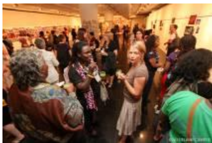
Exhibition inauguration, 25