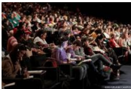
Conferences on 26 th and 27 th August