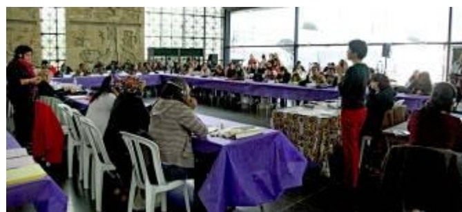
Plenary meeting on the 28 th August