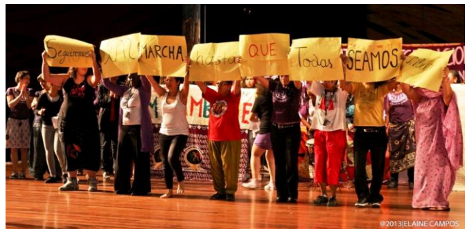
“Women on the March Until We are all Free!”, 9 th International Meeting final assembly, morning of 31 st August

The city of São Paulo, Brazil, was the epicentre of debates, actions and displays of cross-border feminist solidarity, during the 9 th International Meeting of the World March of Women, held from the 25 th – 31 st August, under the slogan “Feminism in March to change the World!”. The IM was attended by 1,650 women from different parts of Brazil and the world, including delegates, observers, workers and guests from invited movement and organisations: ALAI – Latin American News Agency, Friends of the Earth International, AWID – Association of Women’s Rights in Development, ITUC – International Trade Union Confederation, REMTE – Network of Women Transforming the Economy, GGJ – Grassroots Global Justice, Via Campesina, Women on Web, WRM – World Rainforest Movement, WIDF – Women’s International Democratic Federation and OIF – International Francophone Organisation, OIF. The participants came from a total of 50 countries: Afghanistan, Angola, Argentina, Australia, Bangladesh, Basque Country, Belgium, Bolivia, Brazil, Bulgaria, Burkina Faso,