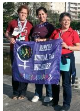
Arab World-Middle East region