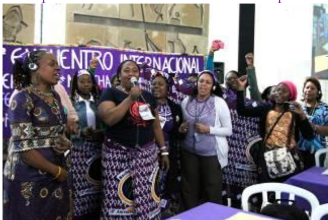
Mozambican delegates demonstrate their commitment to the International Secretariat and the WMW

facilitating and supporting the International Committee, and the preparation of the 4th International Action. Another organisational challenge for the new IS will involve gaining familiarity with the training processes developed by the WMW at the national level and, from that, preparing a proposal to extend those processes internationally.