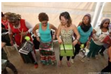
“Batacada” (drumming) workshop

This newsletter provides a summary of the IM’s key moments and decisions.