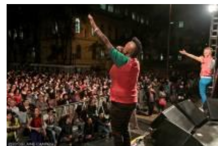
Feminist hip hop from Cuban group Krudas Cubensi, during the closing act, on the 31 st August