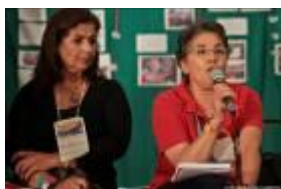
Morocco and Tunisia

Democratic Republic of the Congo, Greece, Guatemala, Haiti, Mali, Morocco, Palestine, Tunisia and Western Sahara. In the face of US threats to invade Syria, we denounced the economic interests concealed by claims of defending human rights, and called for an end to the casualties and the lies. “No nation can be freed by another; only the people can free themselves.”