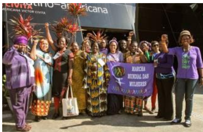
Participants of the Africa region