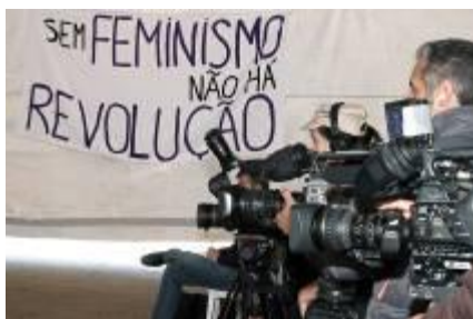
Press conference organised by Social Movements Communications Convergence