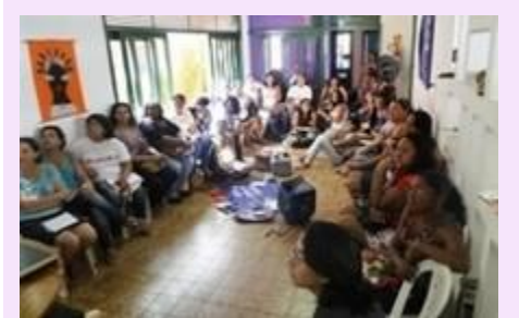
Rio Grande do Norte

WMW committees in several states of Brazil preparing their delegations to participate in the training activities in the run-up to the 9<sup>th</sup> International Meeting. Follow mobilizations in Brazil by visiting: www.sof.org.br