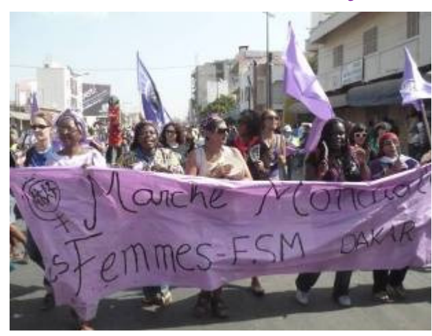
Opening March, on the 6<sup>th</sup> February

Around 75 thousand people came together in Dakar, Senegal, for the World Social Forum between the 6th and 11th February 2011. Caravans from across the West African region were organised, and awareness-raising activities were carried out on their journeys towards Dakar. We, World March of Women activists, took part in several different caravans, with our largest delegations from Mali and Mauritania.