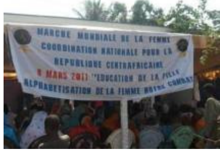
Central African Republic