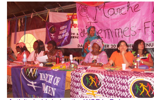
Activity held during the WSF in Dakar

visit. On this day, the silence and isolation suffered by the women of Mwenga was broken.