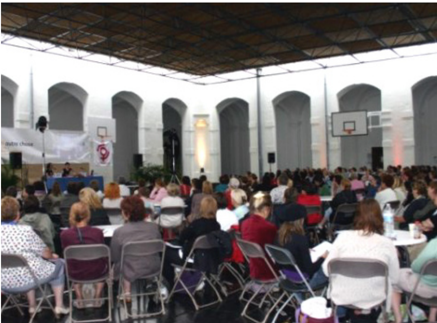
Women participants at the Vie Féminine feminist training

The Belgian National Coordinating Body has taken its first steps towards the organisation of the Global Action 2010: WMW members have sent out a call for participation to women’s groups around the country for the preparation of a common action on 8th March 2010.