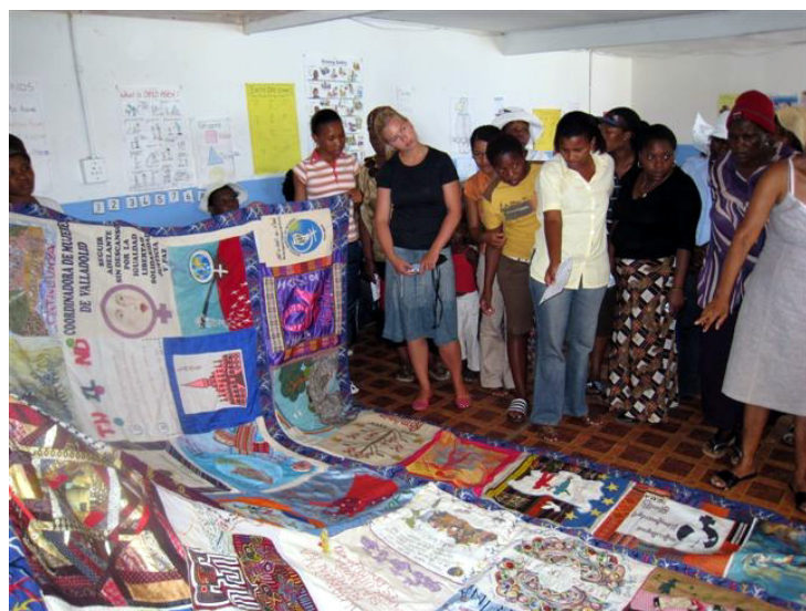
International Women's Day 2008 in South Africa

In South Africa, the WMW's newest NCB is one short step away from being officially formed, with a national meeting having been held in the first week of September, before the Galician International Meeting. The activism of WMW members in the country has long been recognised and valued among women's, grassroots, rural and trade union groups, and the creation of an official NCB is generating a lot of enthusiasm from women in these sectors. The Rural Women's Network, for example, has asked the WMW to help to