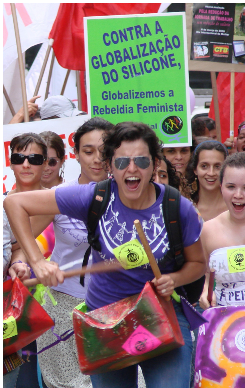
"Against the Globalization of Silicone, We globalize Feminist Rebelliousness!" The Brazilian batucada (drumming group) demonstrates its irreverence

The form and shape of women bodies, controlled throughout history, can today be purchased according to the standards dictated by fashion. According to the secretary-general of the Brazilian Society of Plastic Surgery, in an