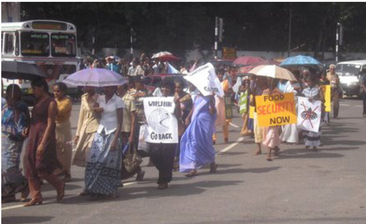
Women participate in the mass rally on the last day of the People's SAARC in Colombo