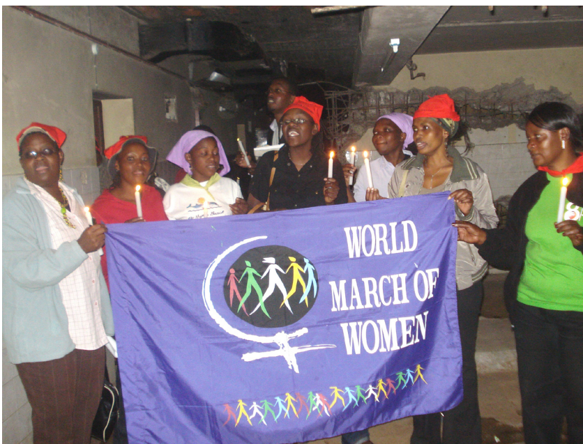
The WMW in Kenya remember the International Day in Support of Torture Victims

In June, two principal days of mobilisation were co-organised, the 26th and 27th. The WMW marked the International Day in Support of Torture Victims on 26th with a peaceful gathering outside Nyayo House in Nairobi which was used by Moi's administration in the 1990's for holding and torturing