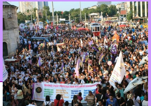
MMF European meeting in Istanbul - June 2010

In 2010, 3rd WMW International Action took place. Through Europe, actions were taken in France, Pays Basque, Galicia, Portugal, Greece, Suisse, Poland, Turkey, Macedonia, Cyprus, Italy, in the Balkans ... The European action in Istanbul gathered 3000 women from 22 countries .